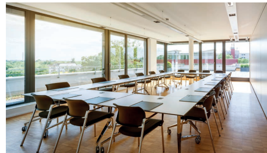
Meeting rooms Yellow, Green and Blue (flexibly combined)